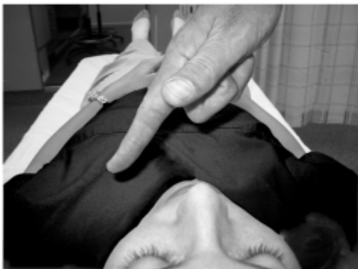
Figure 1: Head tilt/chin lift manoeuvre

One hand is placed on the forehead or the top of the head. The other hand is used to provide Chin Lift. The head (NOT the neck) is tilted backwards (see Figure 1). It is important to avoid excessive force, especially where neck injury is suspected. When the person is on their side, the head will usually remain in this position when the rescuer's hands are withdrawn.