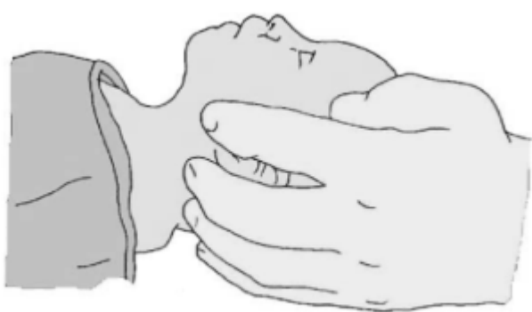
Figure 2: Infant in neutral position

In an infant, the upper airway is easily obstructed because of the narrow nasal passages, the entrance to the windpipe (vocal cords) and the trachea (windpipe). The trachea is soft and pliable and may be distorted by excessive backward head tilt or jaw thrust. Therefore, in an infant the head should be kept neutral and maximum head tilt should not be used (Figure 2). The lower jaw should be supported at the point of the chin while keeping the mouth open. There must be no pressure on the soft tissues of the neck. If these manoeuvres do not provide a clear airway, the head may be tilted backwards very slightly with a gentle movement. [Good practice statement]